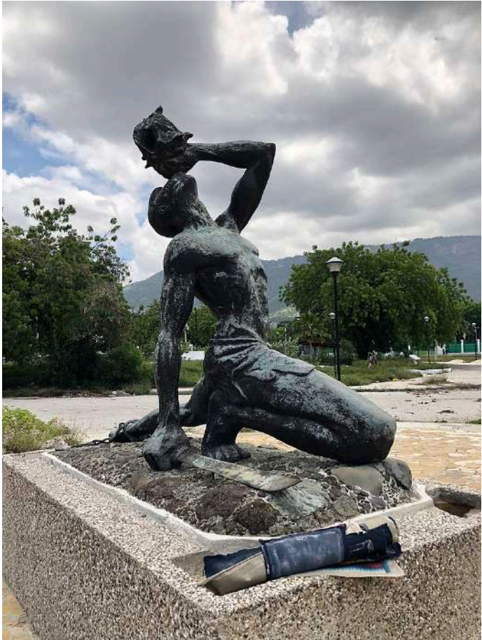
Le Marron Inconnu (Nèg Mawon) / The Unknown Slave (Maroon Man), Port au Prince. Completed in 1969, it is dedicated to the abolishment of slavery and freedom of all black people. (Wikipedia)