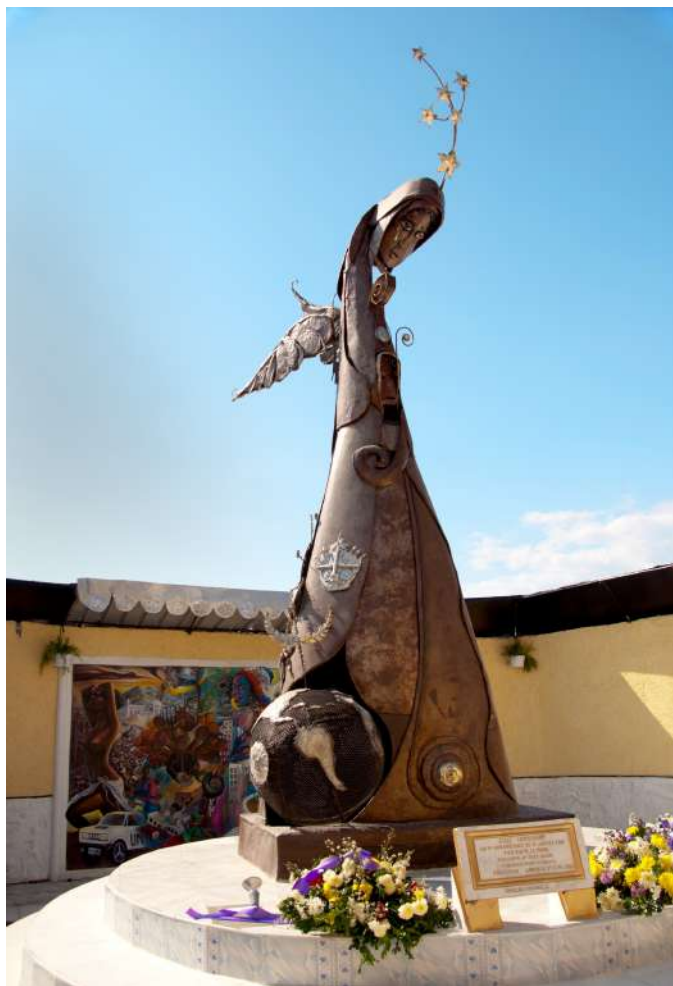
Earthquake Memorial In the Grand Cemetery of Port au Prince