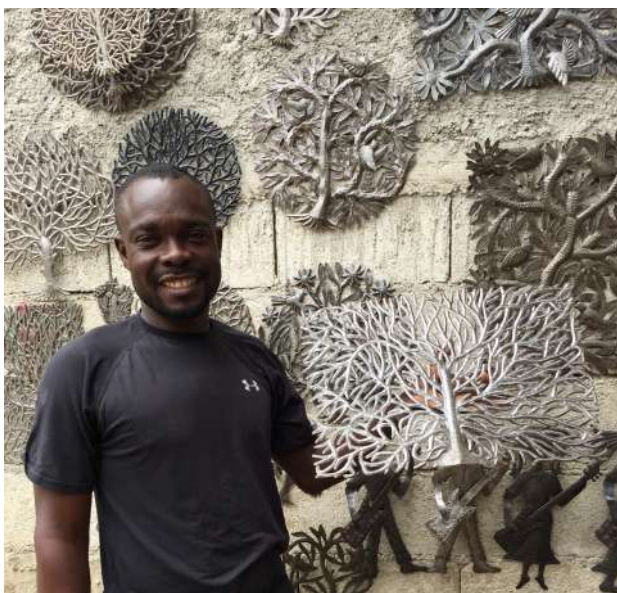
One of the many talented metalwork artists in Croix des Bouquet