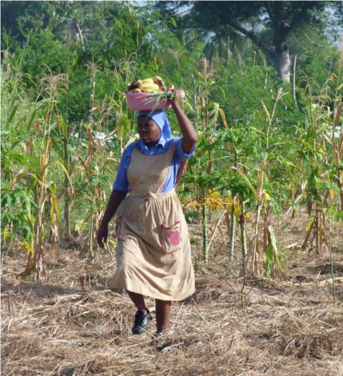
One of the Sisters working on Bethlehem Farm.

Our goal is to follow in the footsteps of our founder and create meaningful relationships and work side by side with our partners in Haiti, fundraise for projects that make a real and lasting difference, and help Haitians help Haitians end poverty through education, elder care, and sustainable farming.