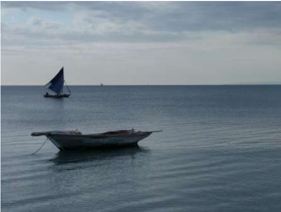
Fishing beach in Leogane