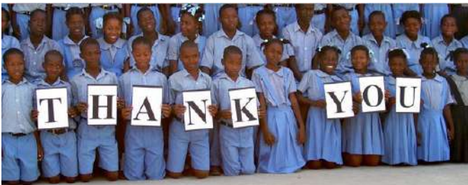
Kids at Annunciation Leogane

Rejoice in Mission Haiti and please, keep it happening. Peace be with us. January 2013