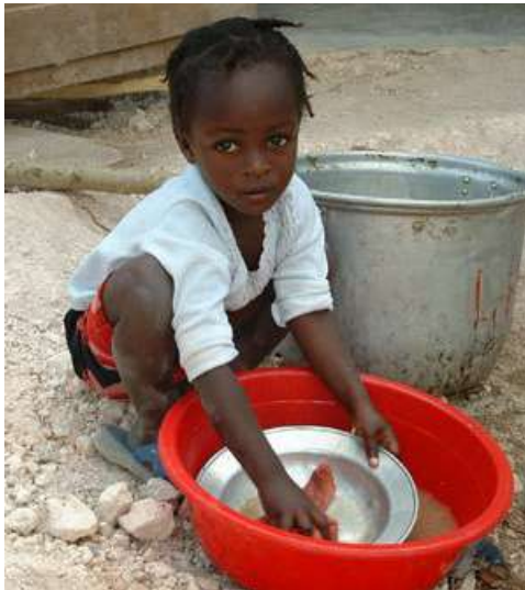
A Haitian restavek

Unless otherwise noted, information in "About Haiti" is gathered from The CIA World Factbook. Online. Accessed 11.30.2017.