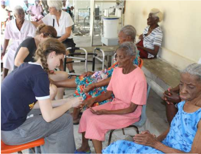
Painting fingernails—part of “spa day” at the Village.

Since that time, MHI has expanded our partnership with the Sisters in Leogane to include support of an elder care home, The Village of Jesus , and a farm.