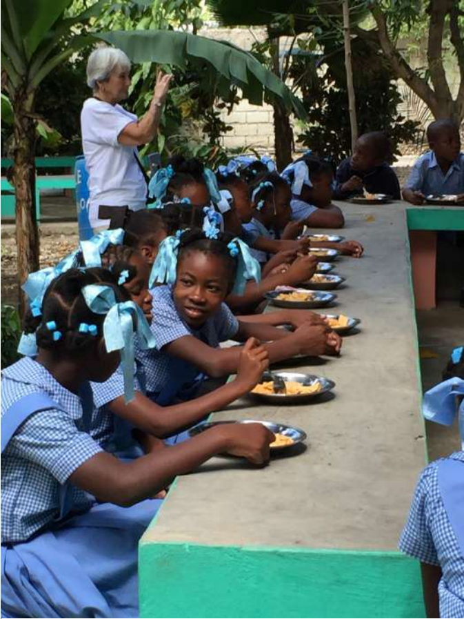
Lunch at Annunciation Leogane.